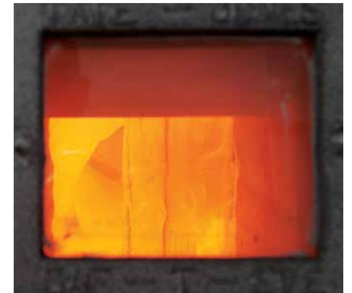
When exposed to high temperature in the event of fire, PPG PITT-CHAR NX system forms an insulating char

When exposed to the high temperatures of the fire, PPG PITT-CHAR NX expands to form a robust, insulating char that significantly reduces the rate of heat up of the protected item. The insulation maintains steel integrity, and hence buys crucial time for personnel to escape and equipment to function on demand.