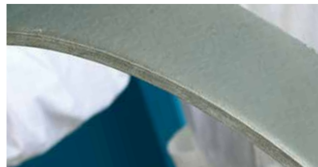
The unique flexibility of PPG PITT-CHAR NX resists cracking