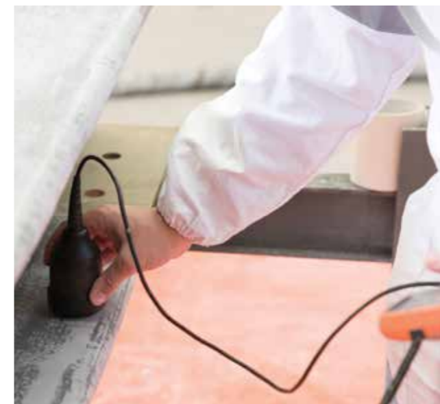
PPG PITT-CHAR NX is only 7.98mm (314 mils) thin for 2 hour UL 1709 applications

In addition to the substantial material savings from using PPG PITT-CHAR NX, the reduction in PFP weight on topsides and steel structures also reduces both transport and construction costs.